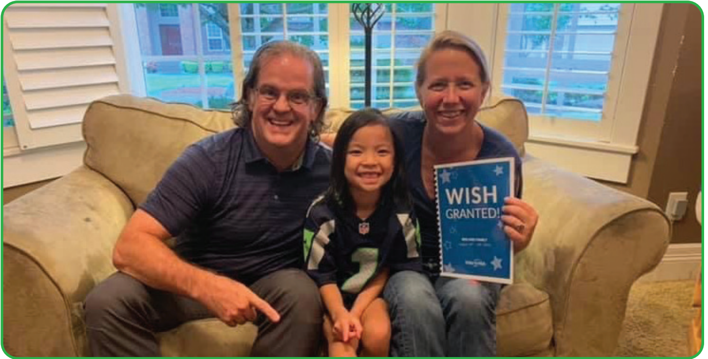
Wish Granted! This young girl's wish was granted to meet the Seattle Seahawks.

Being better together begins with being involved in our communities. ATRIO Health Plans supports a variety of projects and charitable causes and has chosen to spotlight a worthy cause that embodies who we are as an organization.