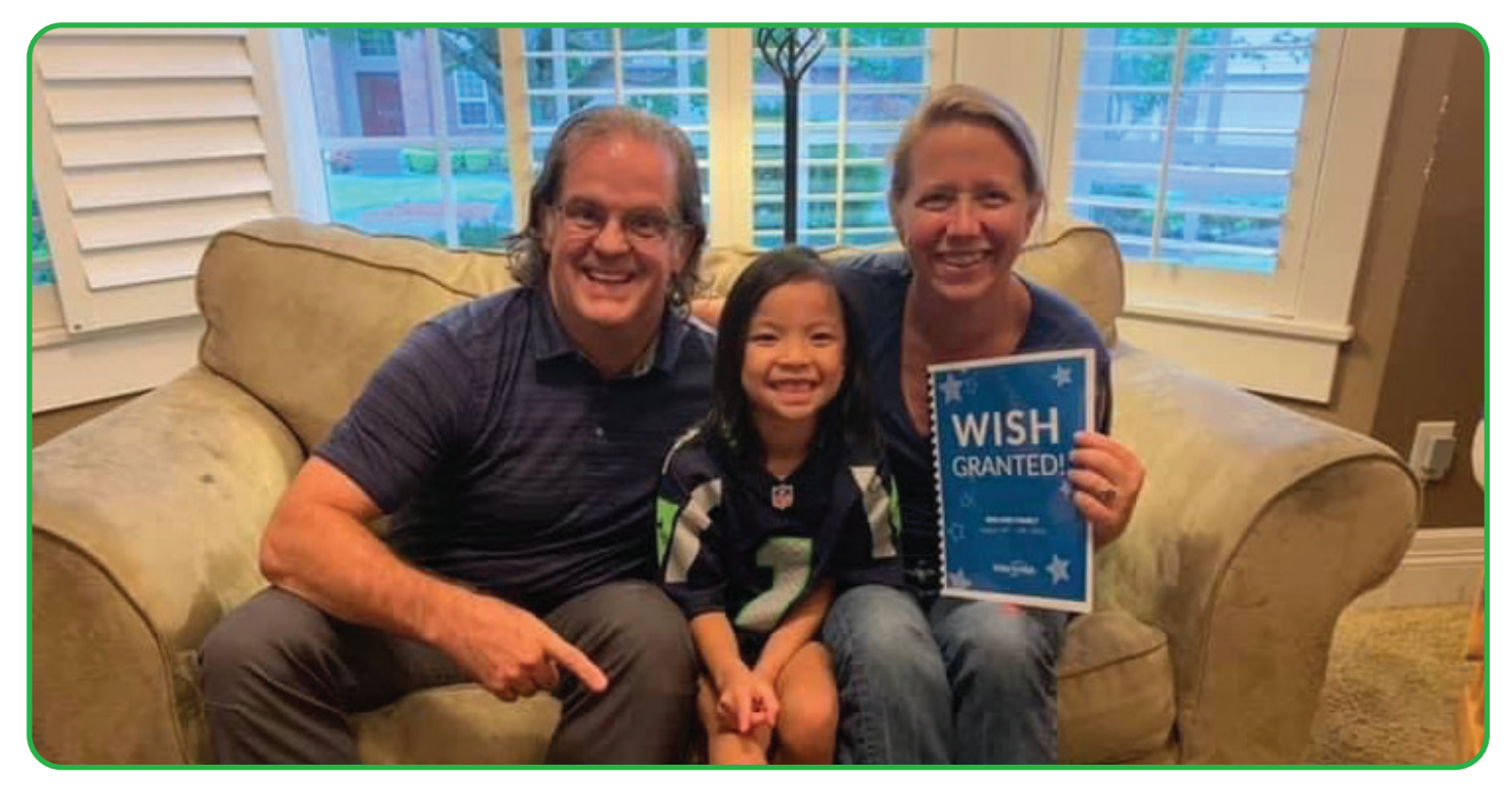
Wish Granted! This young girl's wish was granted to meet the Seattle Seahawks.

Being better together begins with being involved in our communities. ATRIO Health Plans supports a variety of projects and charitable causes and has chosen to spotlight a worthy cause that embodies who we are as an organization.